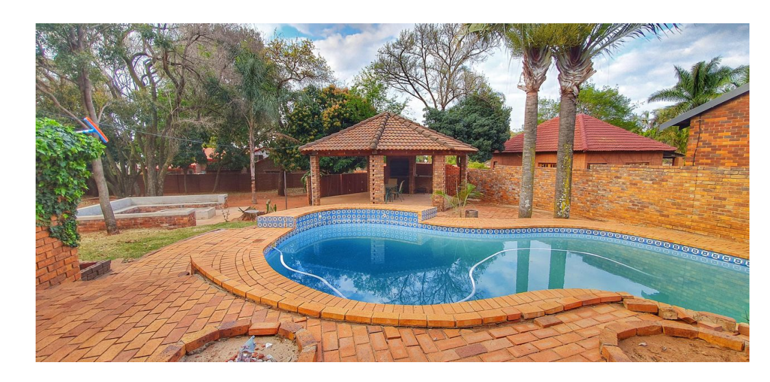
Web Ref RL12607